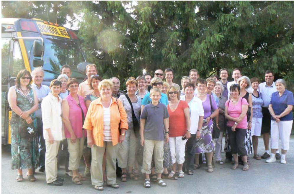
Celebration of Confirmation on Pentecost Sunday, June 12, 2011